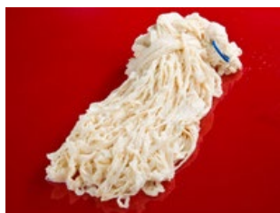
Natural casings / hog